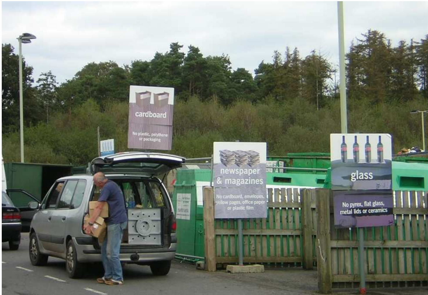
Mike Read Associates